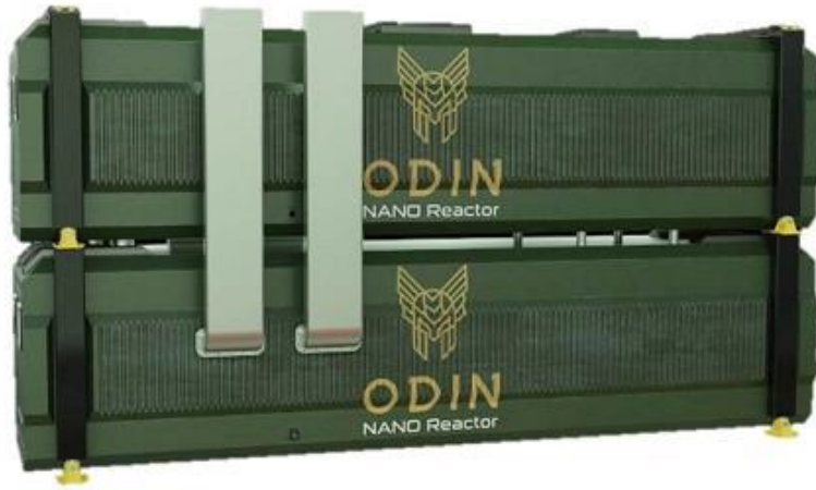
Renderings of proposed "Odin" Microreactor