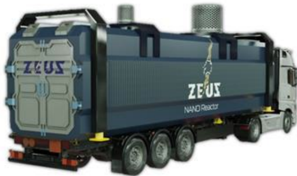
Renderings of proposed "Zeus" Microreactor